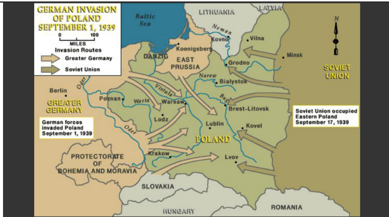
World War II Begins: The Invasion of Poland and the Eastern Front